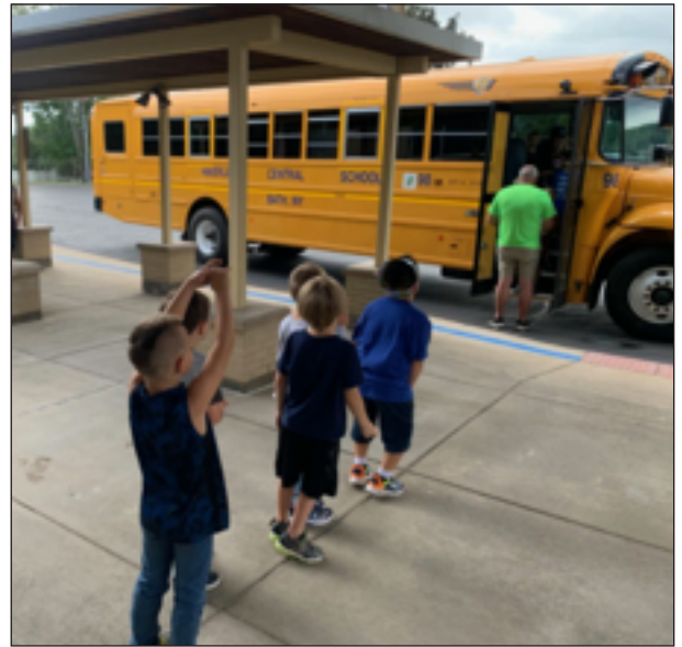
Students participated in bus safety drills taught by Haverling Transportation staff during the first week of school.

Special thanks to members of the Haverling Transportation Department who taught proper bus safety rules to students during the first week of school. Last year, Haverling buses covered 393,855 miles during the school year and we all are doing our part to make sure that everyone arrives at their destination safely.