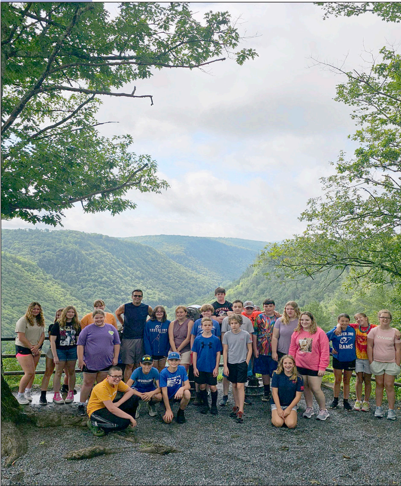
Students explored the geology of the Finger Lakes and beyond as they visited Filmore Glen State Park (right), the Mt. Morris Dam (upper right) and the Pennsylvania Grand Canyon (above) this summer.